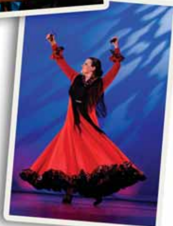
Below photo: Los Companeros de Baile Spanish dancer.