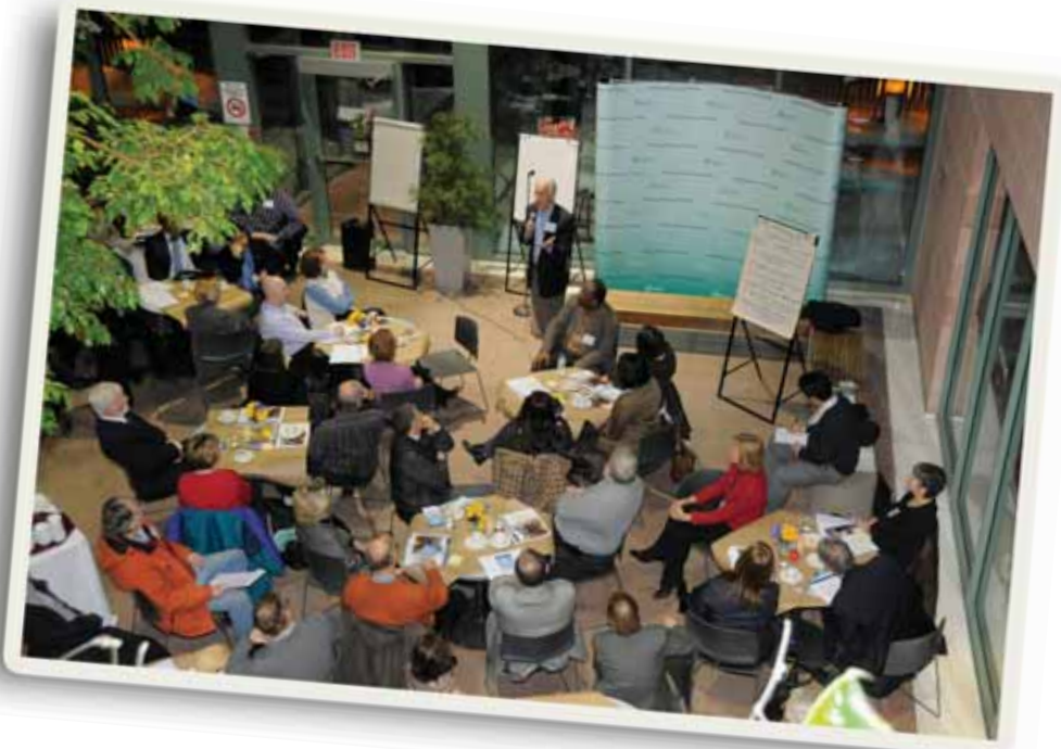
Markham residents participate in unique, informal roundtable discussions during the first ever World Café.

Looking forward, Markham's priorities and action plans, with input from residents, will guide the development of the Green Print community sustainability plan – a plan that will help Markham meet the demands of our growing community in an economically, socially, culturally and environmentally sustainable way.