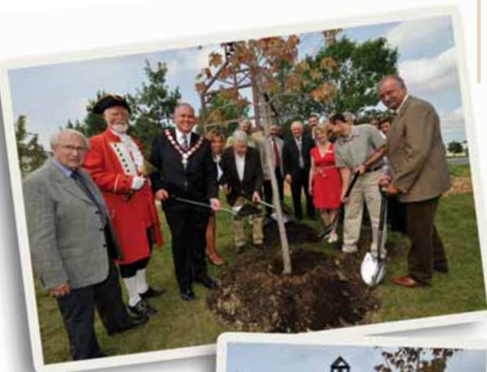
Above photo: Markham Members of Council and Nördlingen delegates participate in a ceremonial tree planting at the Civic Centre, mirroring a tree planted in Nördlingen, Germany in Markham's honour.

In 2001, the two communities established a cultural alliance through a partnership agreement. The agreement set the stage for a number of social and cultural exchanges and activities to promote peace and harmony throughout the world. Cultural groups and dignitaries from Nördlingen and Markham have exchanged visits and performed at festivals since the agreement was in place.