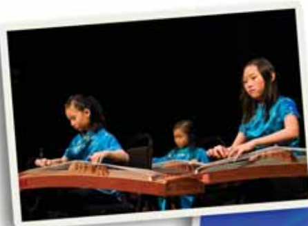
Above photo: Art of Guzheng Music Ensemble

Markham performers were in the spotlight at the 11th annual Many Faces of Markham concert on April 18, 2009. Sponsored by Markham's Race Relations Committee, this year's theme was "Celebrating the Beauty of Diversity" and featured performances from a variety of local talents including the Art of Guzheng Music Ensemble and Spanish dancers Los Companeros de Baile.