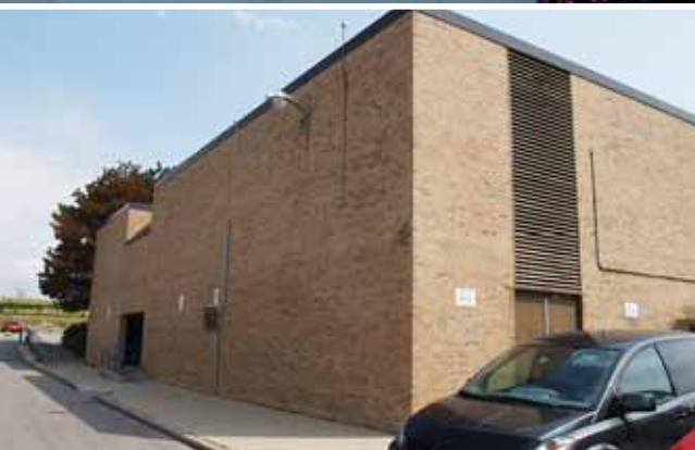
Thornlea Pool 8075 Bayview Ave. Thornhill, ON L3T 4N4 905-889-0766