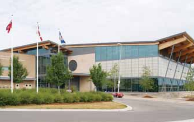
Angus Glen Pool & C.C. 3990 Major Mackenzie Drive, Markham, ON L6C 1P8, 905-944-3777 ext. 7111